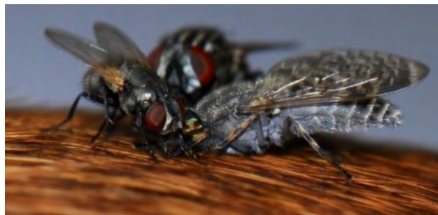
Mechanical vectors biting flies ( Haematopota sp. and Sarcophaga sp. ) feeding on a horse.

African swine fever (ASF): Due to the expanding geographic distribution of ASF in Europe in recent years, EFSA began a major campaign to raise awareness and help halt the spread of African swine fever. Although ASF is considered an (opportunistic) vector borne disease, the role of vectors in the epidemiology in Europe is unclear.