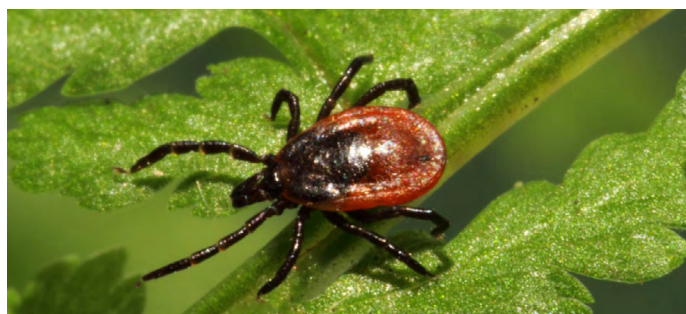
Ixodes ricinus .

After an increase in tick-borne encephalitis (TBE) was reported in Germany in 2020, possibly linked to increased tick densities, VectorNet held a rapid survey among its network on longitudinal observations on densities of the castor bean tick ( Ixodes ricinus ), the main vector of Lyme borreliosis and TBE. Overall, there was no evidence of European-wide increases in tick densities. While tick densities may have increased in some areas, tick density is only one risk factor of tick-borne diseases. Other risk factors, such as human exposure to ticks, may have changed in 2020 compared to previous years.