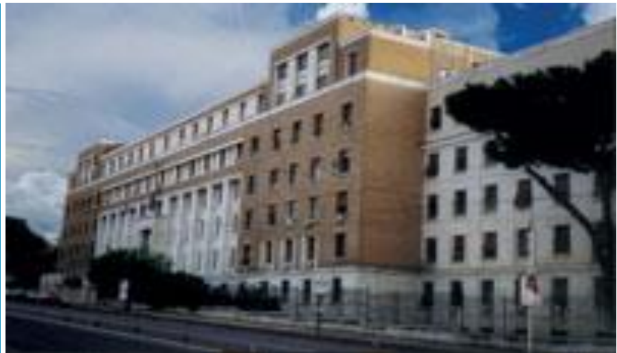
Luca Busani Focal Point Italiano EFSA