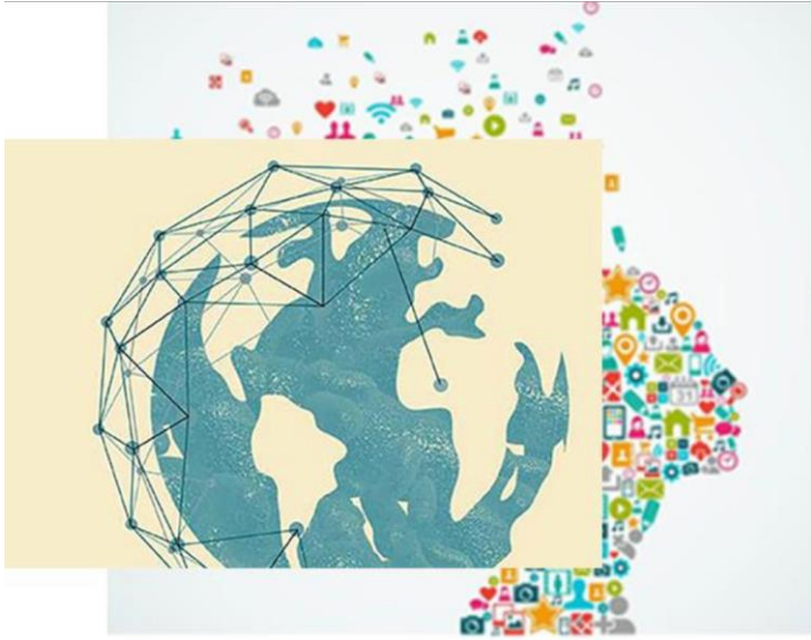
Science Studies and Project Identification & Development Office (SPIDO)