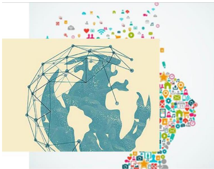
Science Studies and Project Identification & Development Office (SPIDO)