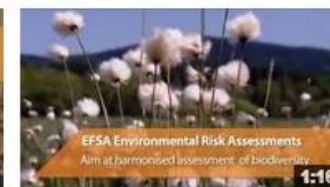
ERA animation 111 views 3 months ago