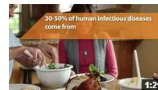
Zoonoses animation 252 views 3 months ago