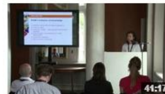
EFSA Seminar @ ESOF 2014 - Science and safe... 384 views 1 month ago