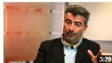
Combating vector-borne diseases in Europe