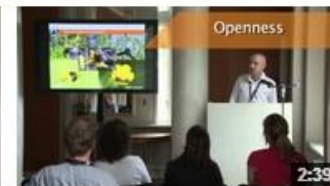
EFSA @ ESOF 2014 392 views 1 month ago