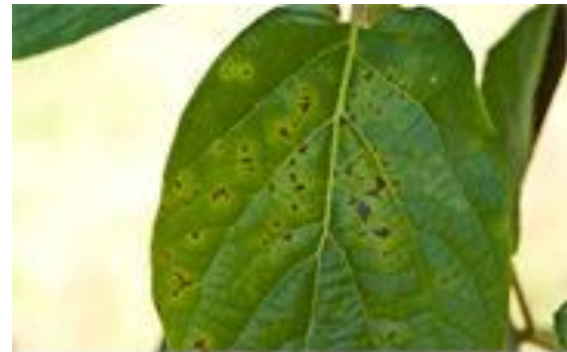
Psa leaf spotting and an infected vine