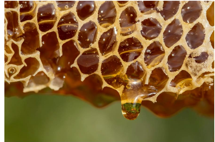
The United States' Food and Drug Administration (FDA) issued a public warning in 2021 and 2022 about honey-based supplements promising "sexual enhancement."

https://www.politico.eu/article/france-warns-of-viagra-laced-erectile-honey-flooding-into-the-country/