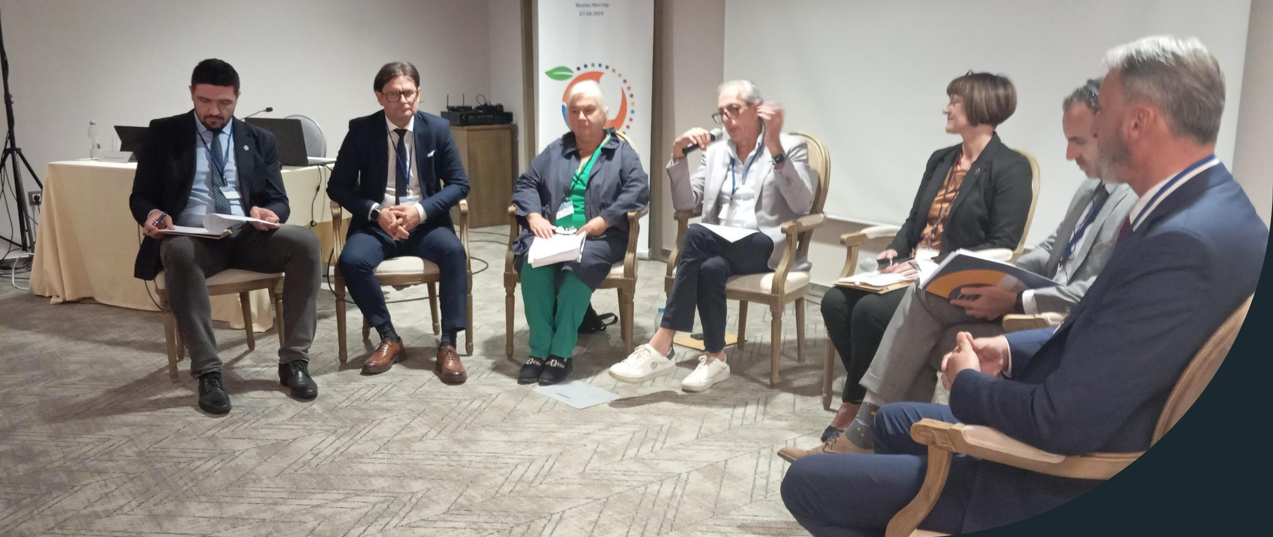
Plenary discussion („One Health: Working together for the health of humans, animals, plants and the environment“)