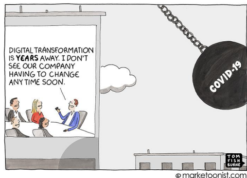
Perceptions and values